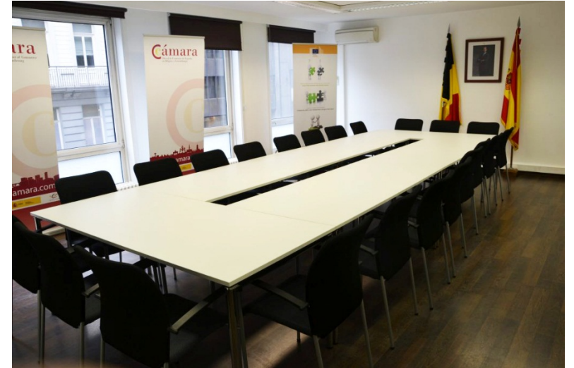
Capacity: up to 24 people