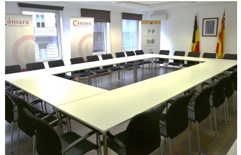
Capacity: up to 28 people